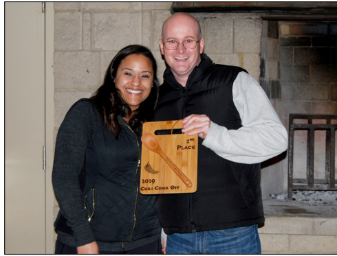
2nd Place Rec!