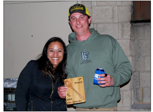
3rd Place Fire!