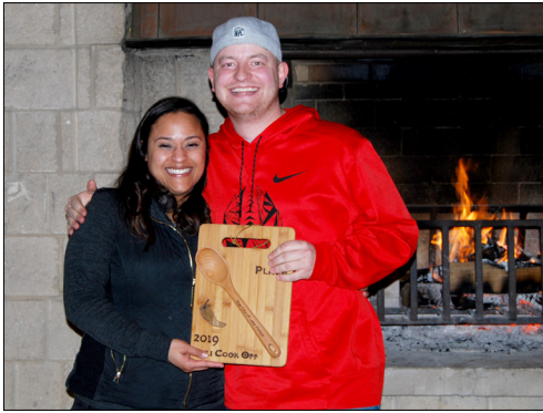
1st Place Building Maint.!